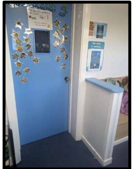
My Classroom (Class 2)